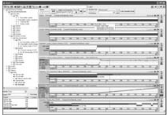
Figure 3. Visitors system interface.

Visitors (Visualization and Exploration of Multiple Time-Oriented Records) is an abstracted semantics intrusion detection visualization and monitoring program that uses Knowledge-based temporal abstraction to represent incident data in different ways for different time scales [Sh06]. The abstraction allows the analyst to aggregate large amounts of data from single or multiple computers into abstractions that can be queried, summarized, or graphically displayed.